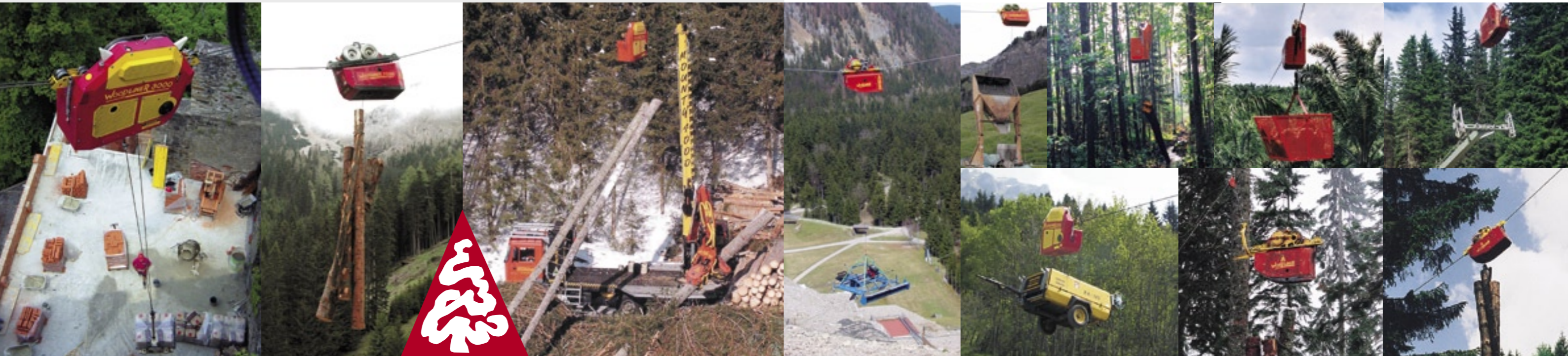
Carrying cable supports for longer distances.